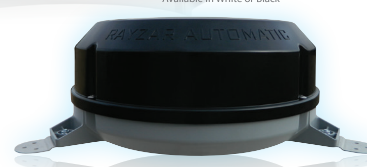
U.S. Patent Pending