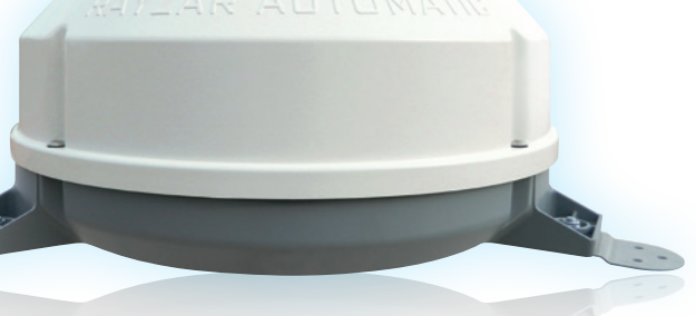
Available in White or Black

"With analog TV, you'd put your antenna up and you'd see a snowy picture," he explains. "By slowly rotating the antenna, you could immediately see how your adjustments affected the picture until the snow went away. With digital signals now it's much different; you have to manually point the antenna in different directions while running a channel scan every time to program the TV until the best location is determined. It can be a lengthy and sometimes frustrating process."